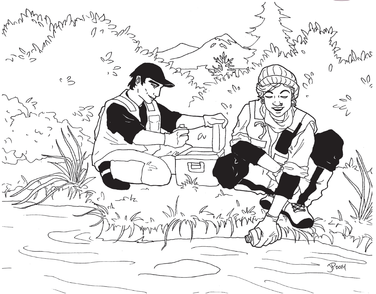
Developed by: Yukon Women in Mining